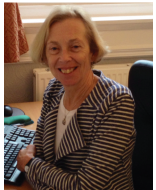
Cathy Warwick CBE (Royal College of Midwives)

For more information and to register visit: